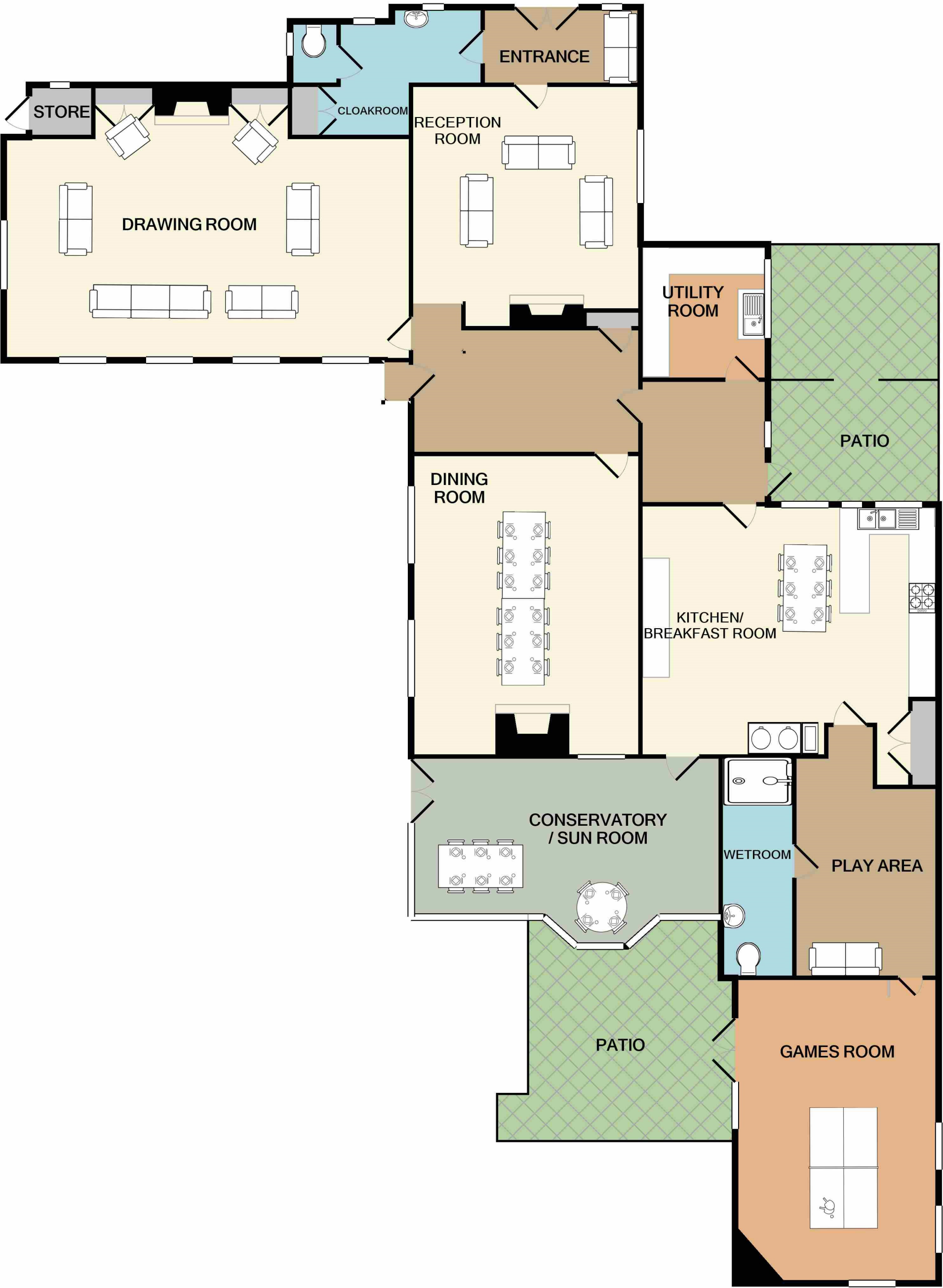
GROUND FLOOR APPROX. FLOOR AREA 3085 SQ. FT. (286.6 SQ.M.)