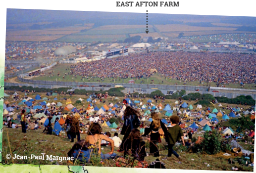
EAST AFTON FARM