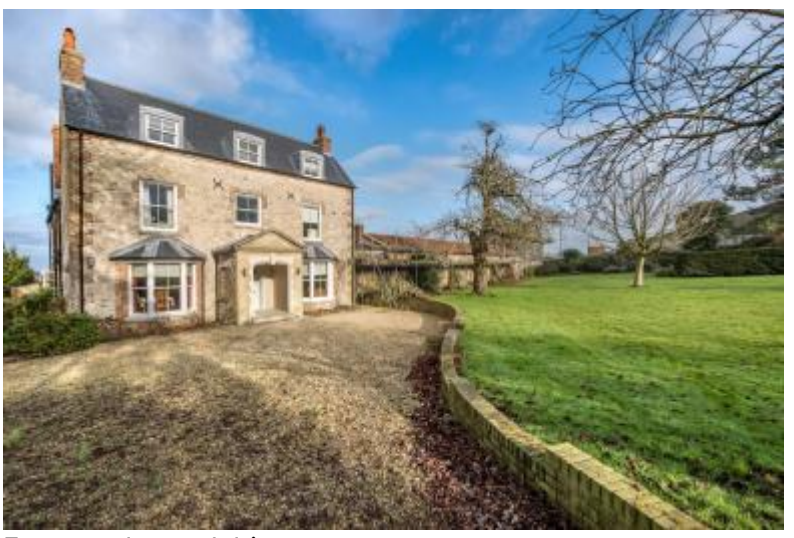
Front garden and drive