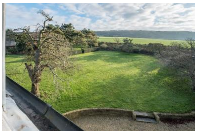
Large front garden

Contact for accessibility enquires: Chloe Baker 01983 758 729