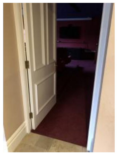
Doorway in to cinema