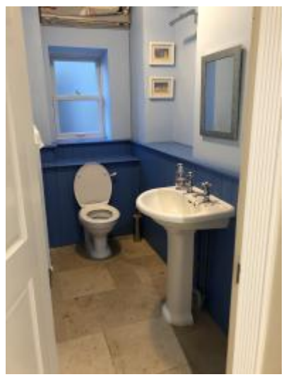
Downstairs toilet opposite single room

Contact for accessibility enquires: Chloe Baker 01983 758 729