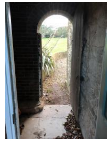
Side gate to front garden