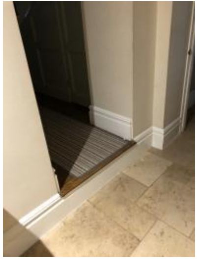
Step up to hall/ lounge/ stairs.