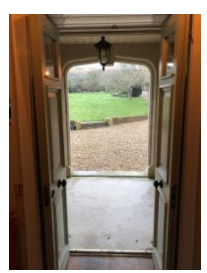
Main front door open