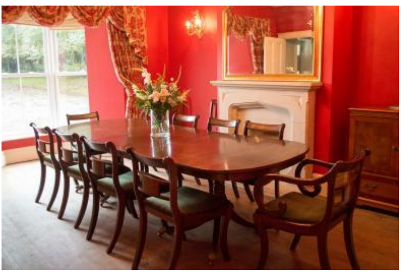
Formal Dining room

Contact for accessibility enquires: Chloe Baker 01983 758 729