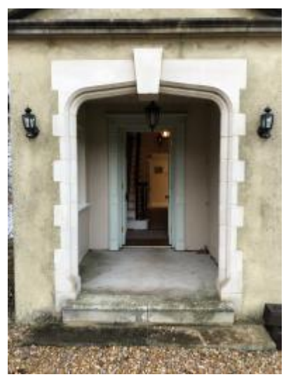
Steps up to main front door from outside