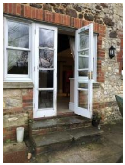
Door from the kitchen with steps down to BBQ terrace