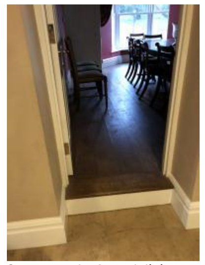
Step up to the formal dining room