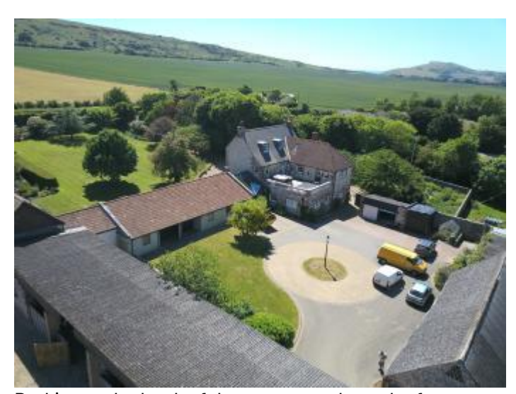
Parking at the back of the property where the front entrance is.