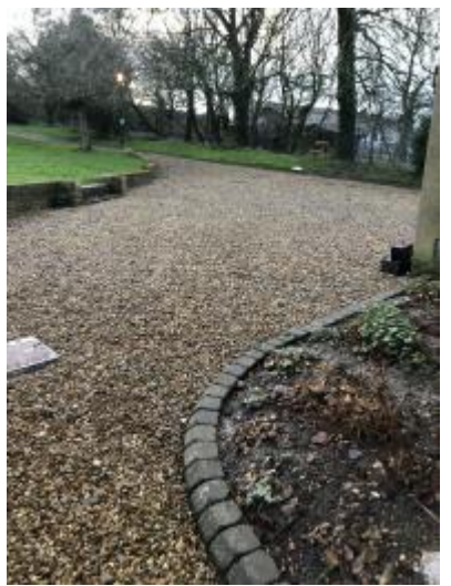
Gravel drive at the front of the house