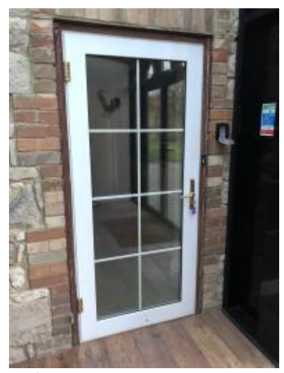
Inside front door

Contact for accessibility enquires: Chloe Baker 01983 758 729