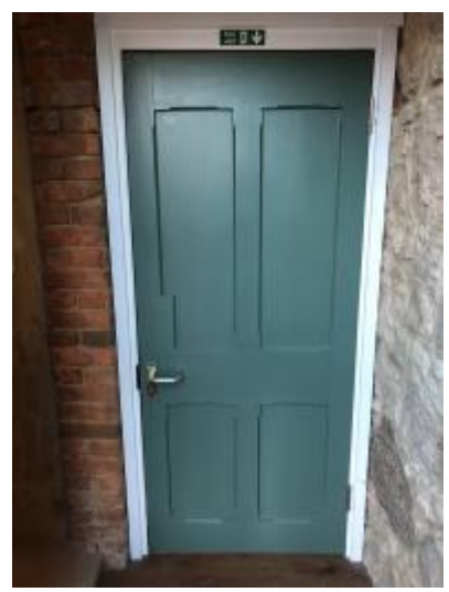
Side door to front garden