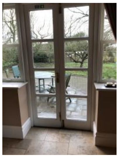
Doors from kitchen to side bbq terrace